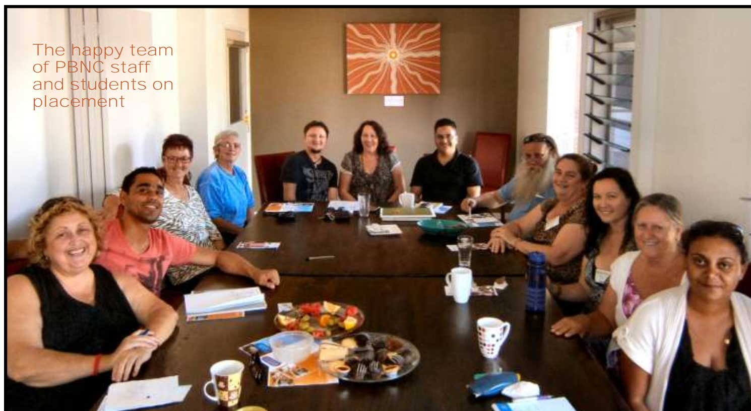
The happy team of PBNC staff and students on placement

Chicken - anything with chicken - just love it!